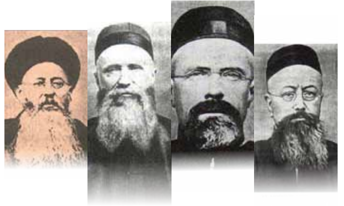
▲ SS Leo Mangin & Companions