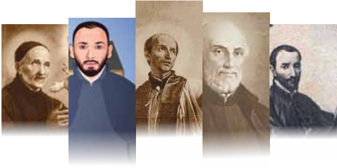
▲ SS B. Realino, Regis, Jerome and other missionaries